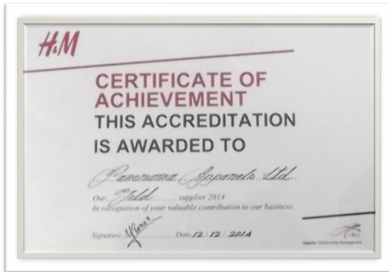
Gold supplier award 2014, from H&M