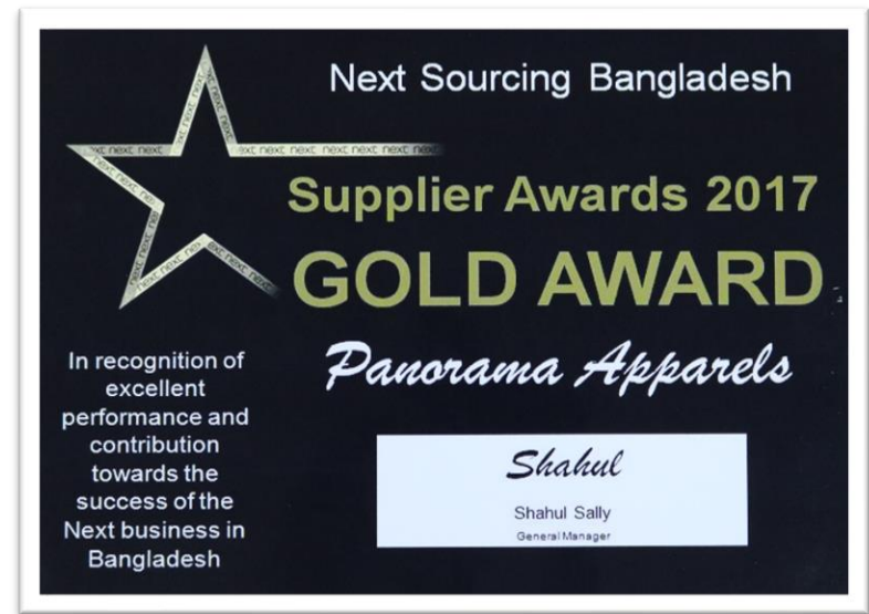
Gold supplier award 2017, from Next sourcing BD